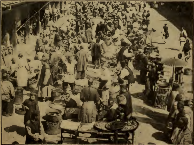
CHINESE MARKET SCENE.